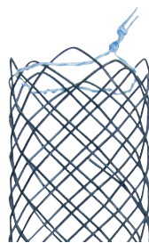
Extraction suture at proximal Stent-End