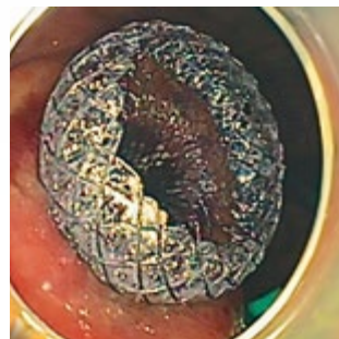
Transgastric access from stomach into pseudocyst