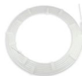
Dispenser guide wires

The wire can be easily ejected and retracted by means of this innovative dispenser. Owing to its compact design, the dispenser is handy and easy to operate. Rinsing the wire is also easy and fast when using the dispenser.