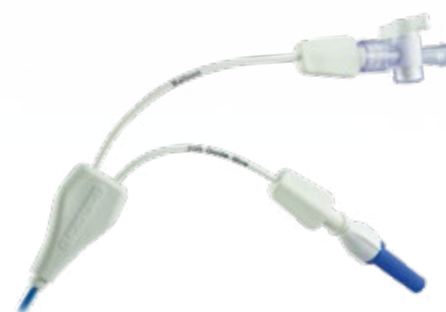
Separate openings for stiffed wire and insufflation